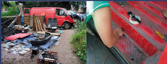
Above Left: Excavation in progress and environmental sampling (above right)

Synanthropic taxa were abundant, including three common pests of stored grain; Oryzaephilus surinamensis , Sitophilus granarius and Cryptolestes ferruginus . Numerous mould beetles were present, most of which are common in decaying plant debris. These included four individuals of the distinctive Aridius nodifer , most commonly found on rotting wood (Hinton 1945, Palm 1959) and three taxa of the minute genera Cartodere and Dienerella ( D. ruficollis , D. filum and Cartodere constricta )