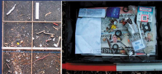
Above: Artefact scatter and objects recovered during excavation

The beetle assemblage was heavily dominated by woodworm, Anobium punctatum (12% all individuals). These are accompanied by a community of 13 other woodland, including bark beetles (e.g. Dryocoetinus villosus ), canopy taxa ( Phyllobius pyri , Polydrusus cervinus ), predatory taxa (e.g. Cerylon histeroides ) and taxa of heavily decomposed wood ( Orthoperus sp.). This implies that the wooden panel flooring of the vehicle was in an advanced state of decay.