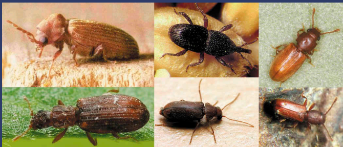
Some beetles of The Van: Anobium punctatum , Sitophilus granarius , Ahasverus advena , Cartodere constricta , Ernobius mollis and Oryzaephilus surinamensis (Top Left to Bottom Right)

The project aim was to investigate a characteristic type of contemporary place, and to establish what archaeology can contribute to understanding the way society and specifically archaeologists use these places. The van was ‘excavated’ systematically, recording all features, structures, deposits and artefacts, as well as introducing specialists for particular tasks (Newland et al. 2007). As part of the excavation, a small sample of fibrous hair-laden material from within the cabin of the vehicle was investigated as to whether any insect remains were present. This contained a surprisingly diverse assemblage comprising 119 individuals from 60 beetle taxa.